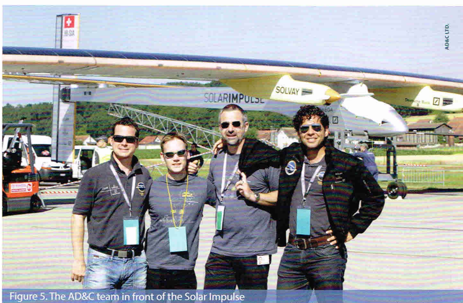
Figure 5. The AD&C team in front of the Solar Impulse

money in the end. If you want to substitute this in the so-called ELA1 (European Light Aircraft) process, somebody has got to pay in the end. Therefore, I'm not convinced this is a good thing to do. Initially, we were very worried that our business concept would collapse, but that's not the case. Not at all. Customers realise experience is important. As an organisation, what do I expect in the future? I think we will have quite some changes in technology. Especially looking at all-electric aeroplane concepts. There's a lot of subsidy money from the European network directed to programs that develop an all-electric aeroplane. A lot of projects come up with electric propulsion systems that are still in its infancy and they don't get very far. This is because of problems regarding the battery capacity for example. Still, it's a new technology, so there will have to be new certification standards to be able to ad-