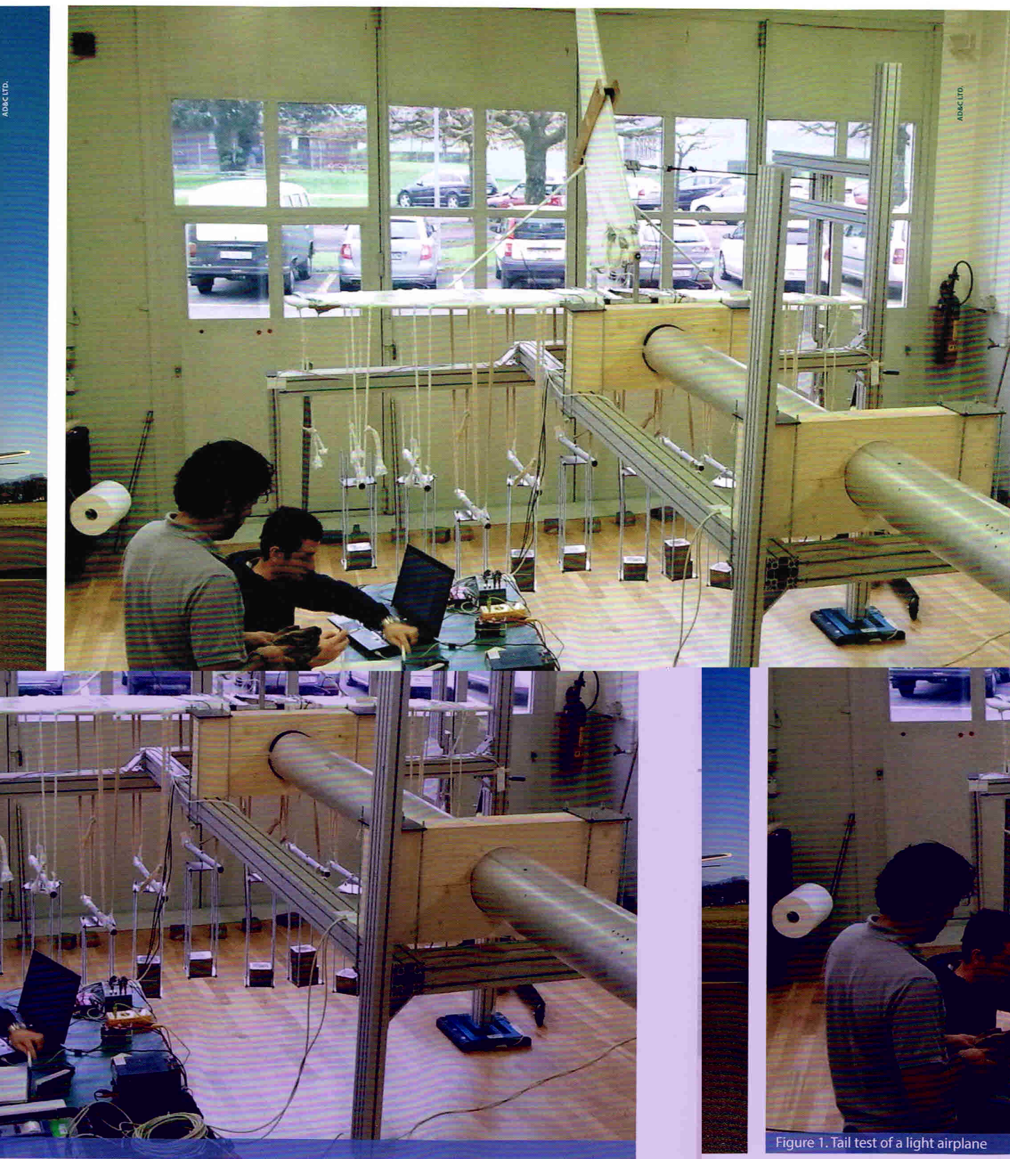
Figure 1. Tail test of a light airplane

to hand in your application; a very formal step. From this moment on, an interesting period starts where one has to work with your counterpart at EASA. This joint team is called the certification team, spearheaded by the primary certification manager. This team discusses which certification basis should be used. There is some flexibility in the choice of the certification basis. In class, students will encounter expressions like CS-23 and CS-25. These are certification specifications. However, the certification basis entails a bit more. It is a summary of everything that you need to do with the