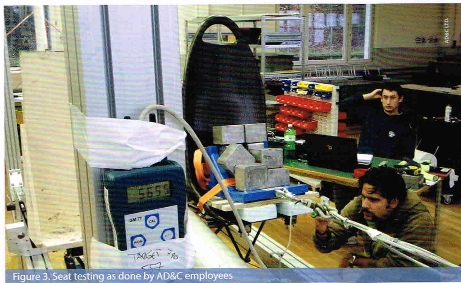
Figure 3. Seat testing as done by AD&C employees

that one has to realize that the type certificate of the engine was drafted while it was assumed that the engine would have a propeller at its flange. In this case, the engine is connected to a gearbox. This will induce different vibrations on the engines. Therefore, the engines are acting in an environment they were not certified for. For me, this is the interesting aspect of the certification process: In those cases we have to work closely with the authorities since the standard set of requirements do not foresee the characteristics of the aircraft.'